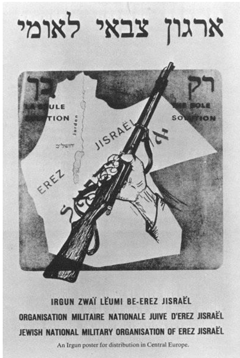
Poster for the Irgun terrorist group

The Israeli bully-boys spend most of their time condemning the terrorism of others and yet their very State was created through terrorism of the most grotesque kind via groups like Irgun and the Stern Gang, which bombed and terrorised Israel into being.